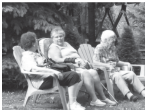
Relax at the "Young at Heart" Seniors Retreat

Check us out on the web at www.luwisomo.org