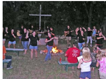
Families enjoy campfire sing-a-long