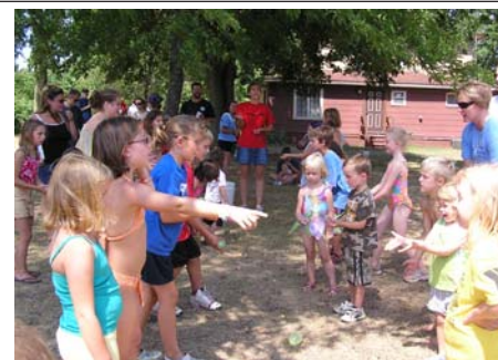
Kids join the fun and games