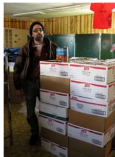
Food donations help keep costs down for campers.