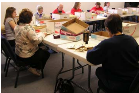
Volunteers of all ages help out with our mailings.

Spring Work Weekend is scheduled for April 18-20, 2008. Tom has several work projects including building projects, remodeling, newsletter mailing, and spring clean up projects to get the