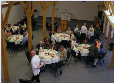
Formal attired guests will enjoy exquisite dining and live and silent auctions at A Taste of Elegance on September 27 th .

For more information about a Taste of Elegance or about donating for the auction, please contact the LuWiSoMo office.