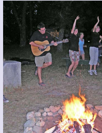
"... it has been an honor to be His servant in such an exciting place of ministry."

While I cannot take credit for anything the Lord has accomplished at LuWiSoMo, it has been an honor to be His servant in such an exciting place of ministry. I have been privileged to serve under the LuWiSoMo Board of Directors and alongside the dedicated staff. The Lord has truly blessed LuWiSoMo with many fine people that I have grown to love and respect. I have especially appreciated the love and support of my