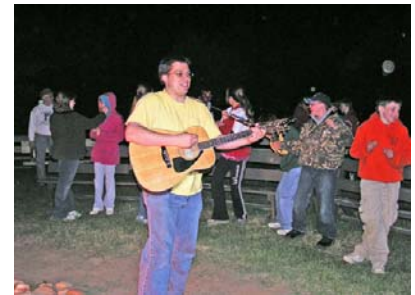
Men will gain spiritual enrichment and insight about being a stronger Christian man at the Men's Retreat.