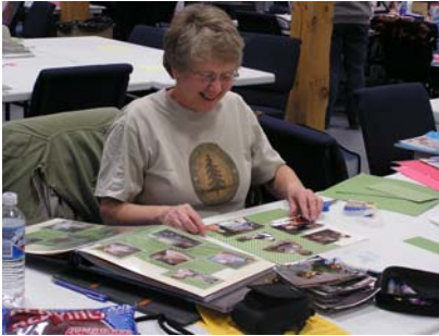
Ladies enjoy scrapbooking their memories.

Ladies - The 5 th joint Stamping and Scrapbooking Retreat, held on November 9-11, was by far the biggest