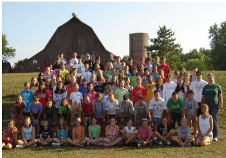
Many Camp ministry opportunities have grown over the past 12 years at LuWiSoMo.

At the age of 23, I began serving as the Executive Director at LuWiSoMo. It is hard to believe that twelve years have already passed. Before coming to LuWiSoMo, I had spent two years at Concordia Seminary in St. Louis. Since the LuWiSoMo Board believed having a pastor on staff would be a benefit to the Lord's ministry at LuWiSoMo, I was encouraged to finish my seminary work, which continued at Concordia Theological Seminary in Fort Wayne. I am excited to announce that, Lord willing, I will graduate on May 16, 2008!