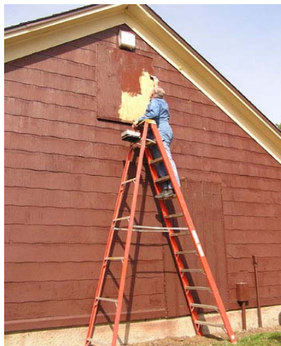
Spring Work Weekend volunteers go to great lengths to get camp ready for summer.

camp ready for over 9,000 campers that will flock to LuWiSoMo this summer to focus on our Risen Hero, Jesus Christ. Many helping hands will make these projects possible to complete. You can take this opportunity as individuals, families, or youth groups to spend a weekend at Camp LuWiSoMo for free! Participants will be assigned work projects based on information collected on their registration form.