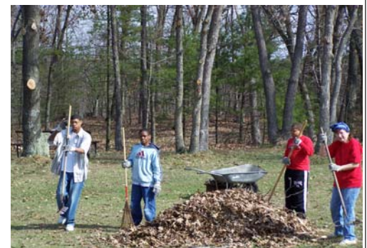
Volunteers help with spring clean up to get LuWiSoMo ready for summer campers.

A worship service will be held on Saturday evening in the Chapel of St. Barnabas. All are invited to stay for LuWiSoMo's Annual Pancake Brunch fundraiser that will be served Sunday, April 20th from 9 am until 1 pm also in the Chapel of St. Barnabas. Funds raised during this event will be supplemented by Thrivent Financial for Lutherans.