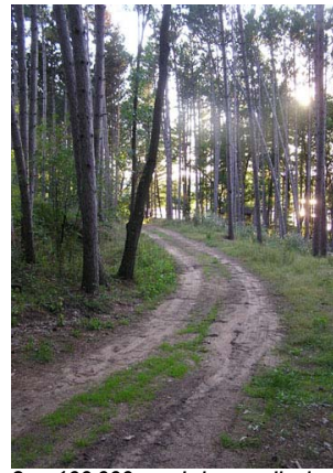
Over 100,000 people have walked the gravel roads at LuWiSoMo the past 12 years.

humbled. During this time, over 100,000 people have walked the gravel roads. Every program at LuWiSoMo has placed an emphasis on proclaiming the love of God shown to us in Christ